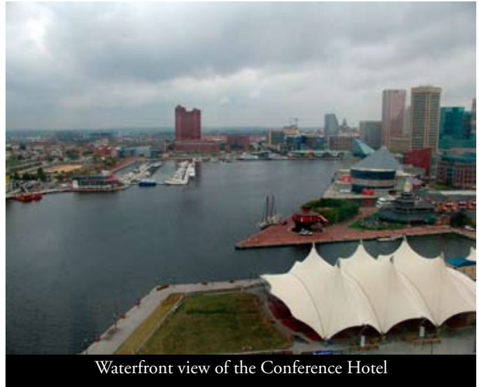
Waterfront view of the Conference Hotel

I look forward to seeing you in lovely Baltimore in late March-early April 2008!