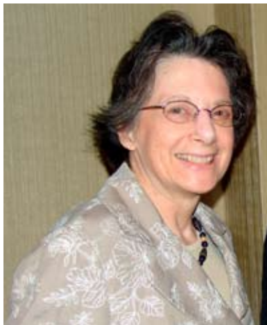
President Penny Gilmer welcomes you to attend the 2008 NARST International Conference in Baltimore.

I recommend that you make your reservations for the hotel as soon as possible too. A link is provided on the NARST Web site: http://www.narst.org/annualconference/2008conference.cfm . The room rate is $199/night but you must make the reservation by March 7th to get this rate. Also we may run out of rooms, so I recommend sooner rather than later. The NARST contract provides free Internet access for those NARST registrants who are staying on the Baltimore Marriott Waterfront.